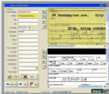
Custom application used for asset linkage