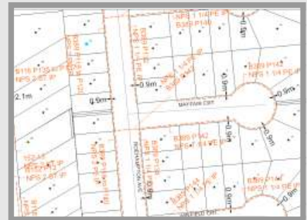
Legacy record linked in GIS