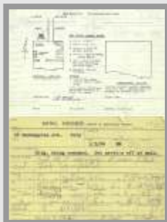
Legacy record sample