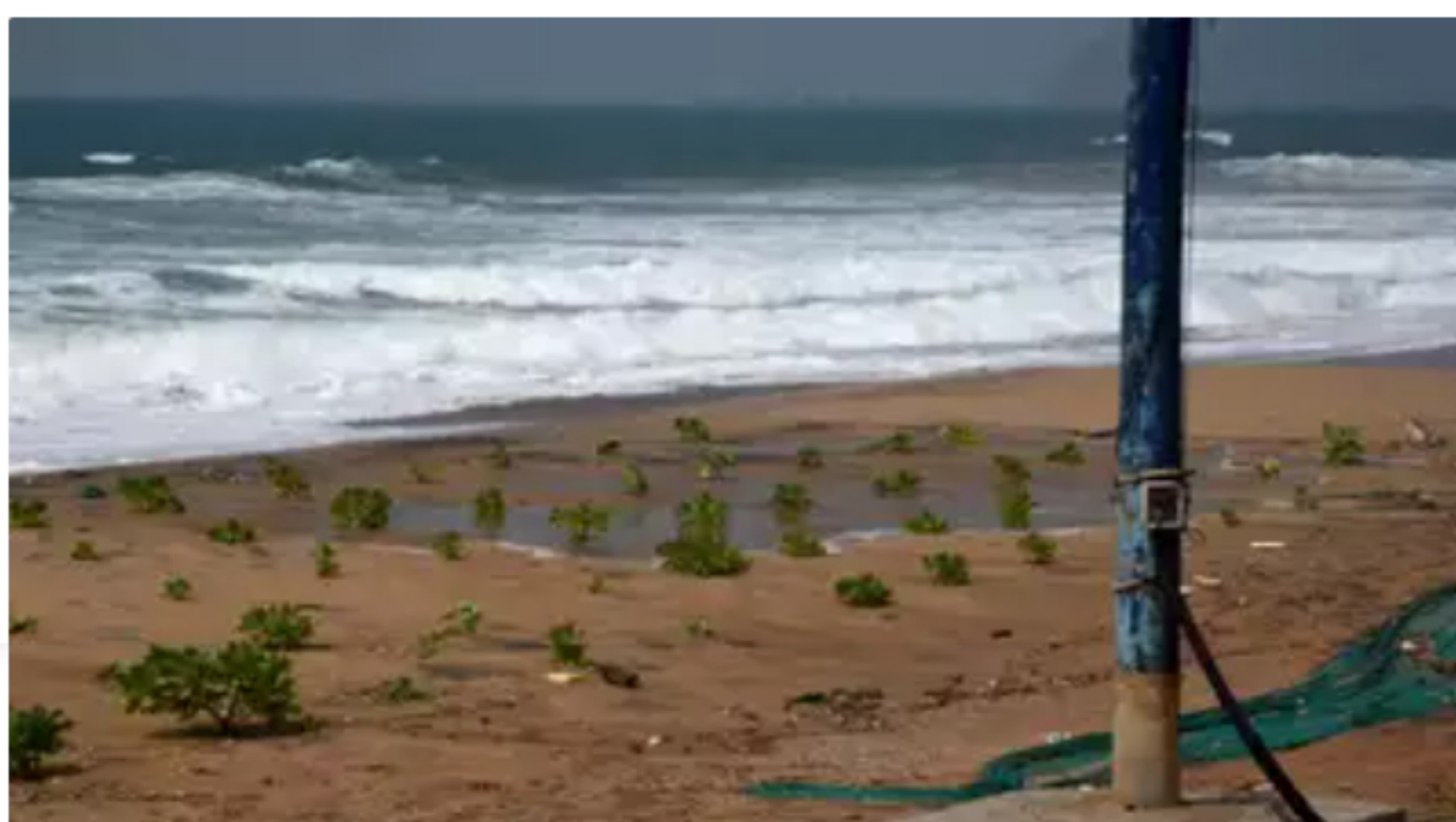
The IMD predicted that heavy to very heavy rainfall with isolated extremely heavy rains are very likely to over NACP on Sunday.

Everything you must know about Crypto Wallets